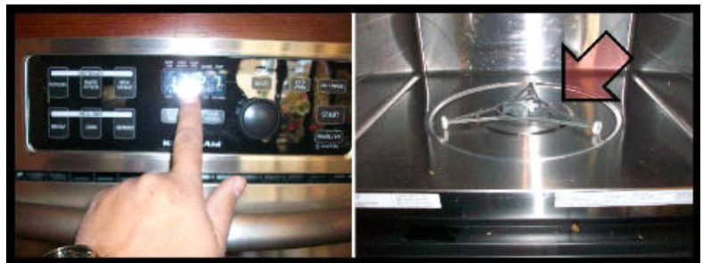
Part of the display is not visible. Glass turn table is missing.